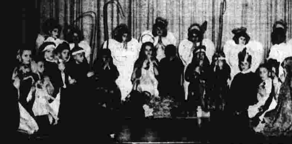
Enact Manger Scene at Robertson School